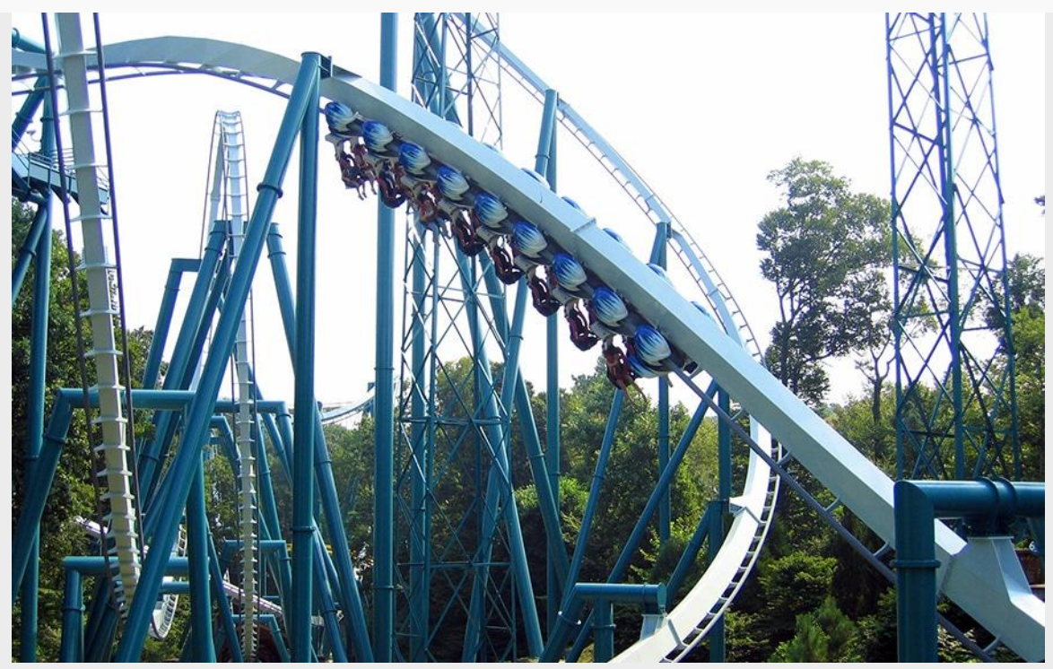
The Alpengeist coaster at Busch Gardens

Travelers who prefer wild rides to history can find lots of thrills at Busch Gardens. Hop on a coaster like the Loch Ness Monster, dine in European-themed restaurants or enjoy fun family-friendly shows and live entertainment throughout the year.