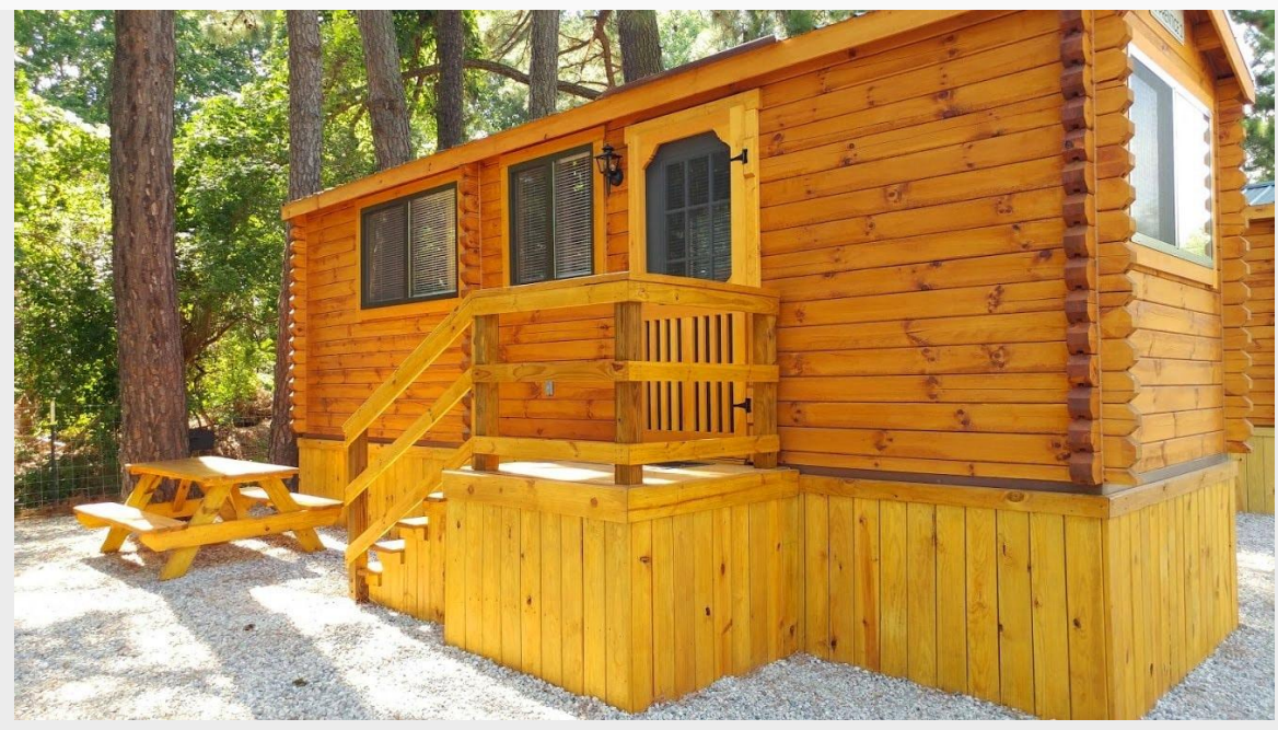
A camping cabin at Anvil Campground.

The utility posts include an amber light for nighttime connecting and hooks to hold an extra water hose.