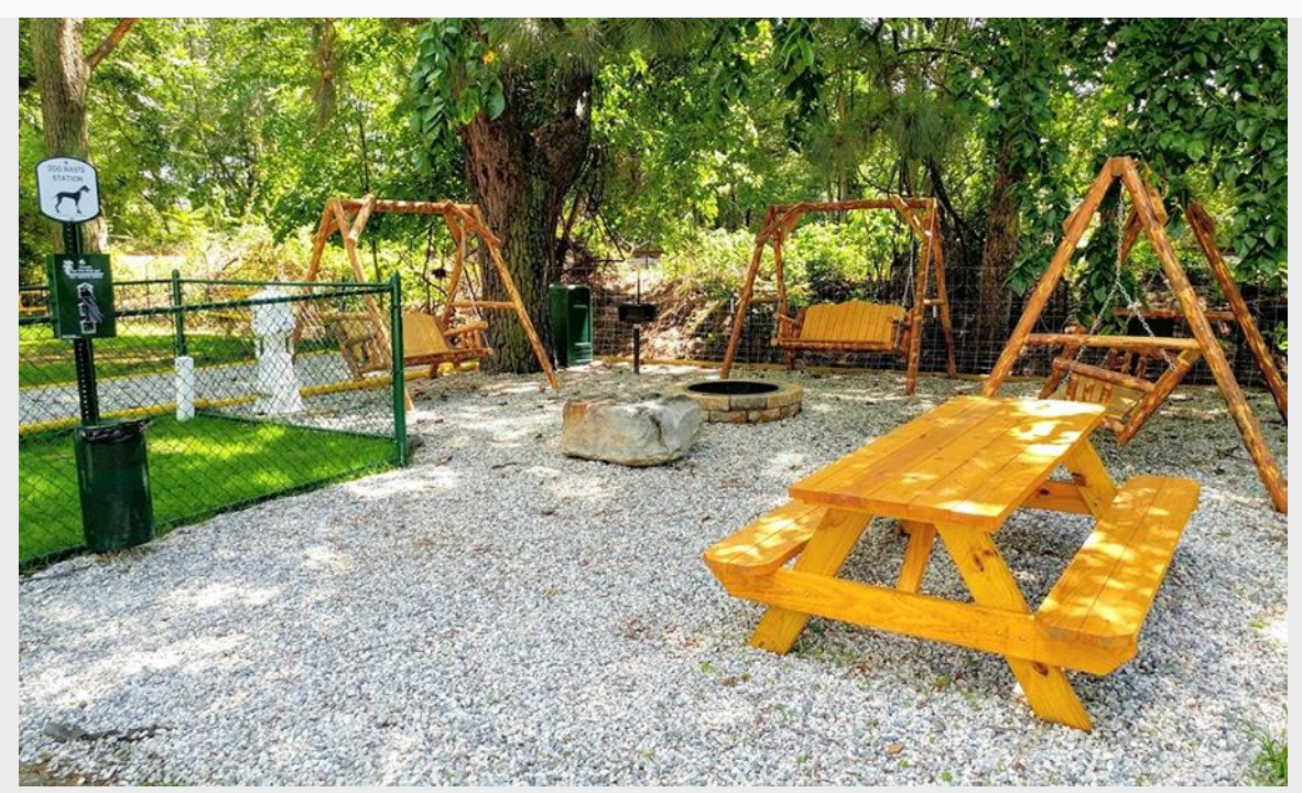
New amenities along with a dog run at one of the park's premium sites

Anvil also enjoys the distinction of being a top-rated Good Sam Park for the last three years and is the second-highest-rated park in Virginia. The Williamsburg campground has been a Good Sam Park for 35 years.