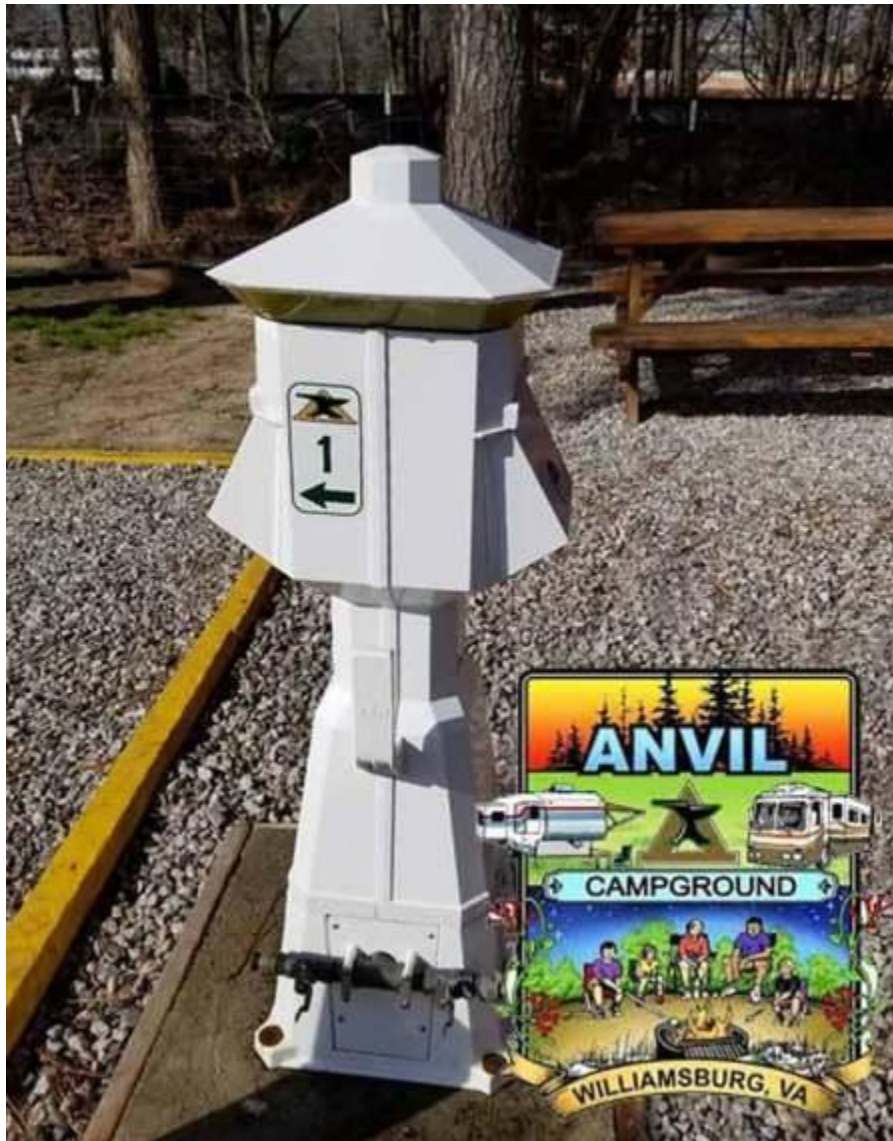
Eaton Powerhouse Utility Pedestals provide guests electricity, super fast WiFi, cable, and water.

Anvil Campground has everything you need for tent sites and RV spots! Wondering if you can stream a movie...the answer is: definitely. This is more of a glamping park than a regular campground. Wait till I get started on the bathrooms.