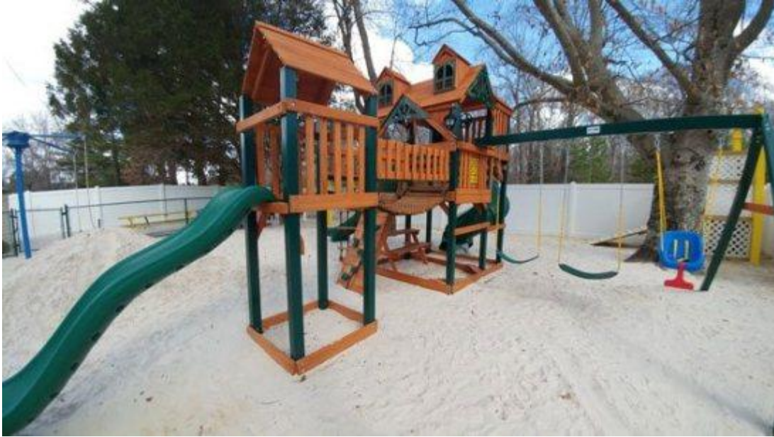
This is only one section of the sandy playground at Anvil Campground, Williamsburg VA

The playground includes a zip line, beach hammocks, twisty slide, big slide, bumpy slide, mini rock wall, rope merry-go-round with Sand Mountain, airplane seesaw, climbing dome, and the secret swing! The Beach Park is shaded by big trees, and is adjacent to a picnic area with hammocks hanging from the trees.