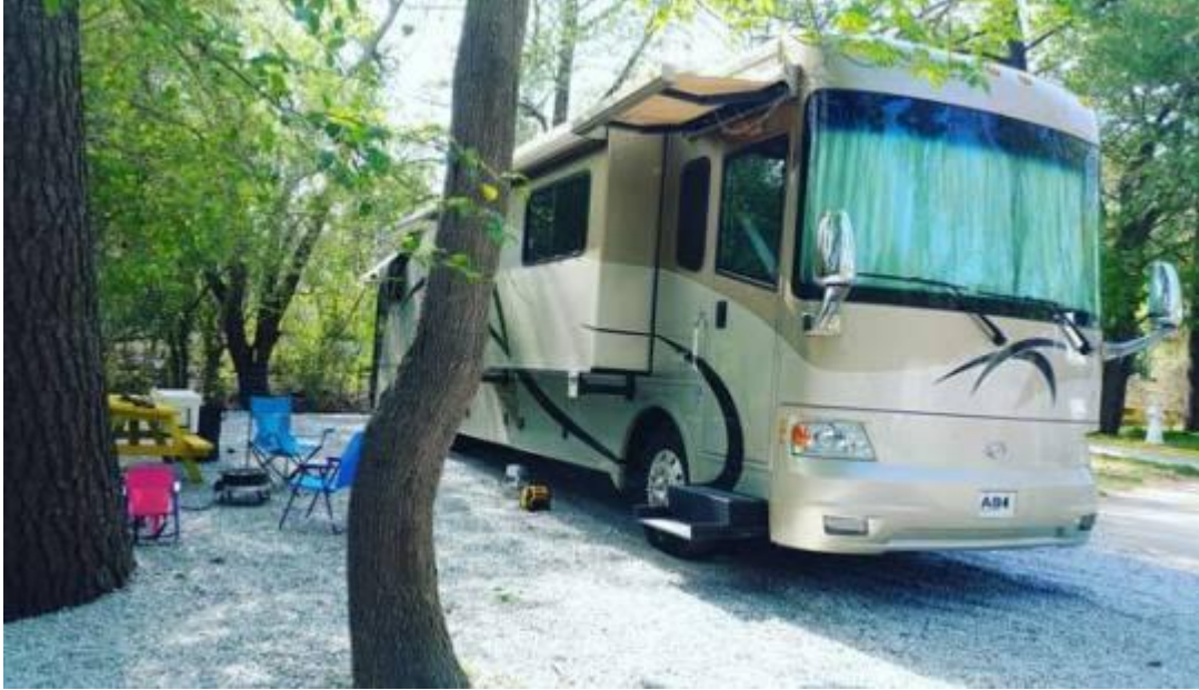
Anvil Campgrounds has regular spaces and premium spaces that are both large enough to accommodate slide-outs

Enough space? If you are coming with a large RV, power, water, sewer and amenities will not be a problem. Anvil has regular spaces and premium spaces that are both large enough to accommodate slide-outs.