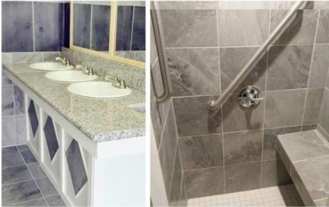
Anvil Campground's showers and bathrooms are not your typical campground facilities.

Now on to the bathrooms. The bathhouse has tile and granite throughout. The single showers have floor to ceiling tile and each have an attached dressing room with private door access. Translation: clean, private, functional and nice. The bathhouse is spotless and beautiful. The men's and women's bathrooms are identical, which in this case means the men's room is just as fabulous.