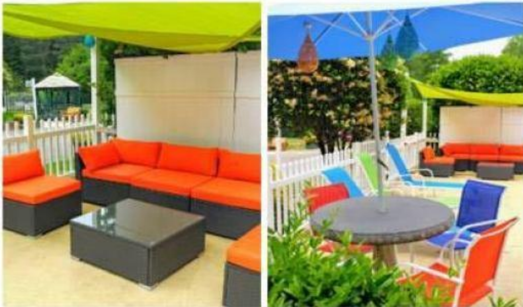
Poolside patio, umbrella tables and a lovely pool await you at the Anvil Campground in Williamsburg, VA

What to do? In the warm weather make sure to bring your swim trunks because there is a great pool, where you can relax while the kids burn off some energy. And next to the pool is a playground known as Beach Park. It gets its name from the 130,000 pounds of beach sand that covers the entire playground.