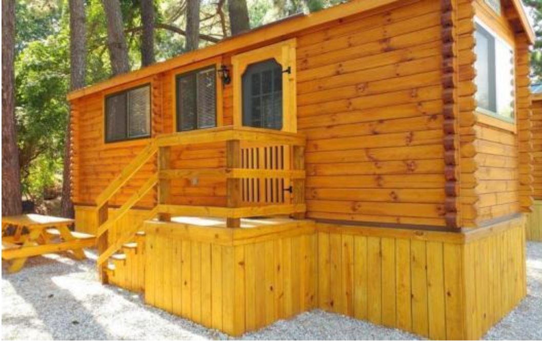
Amish made log-cabins at Anvil Campground

Not a cottage, more of a cabin camper? Past the General Store sit two of Anvil's Premium Log-Cabins handmade by an Amish company in Lancaster, Pennsylvania. They are made with beautiful logs that you see inside and outside the cabins. Each has a queen bed in the front and two sets of bunk beds in the back; each cabin easily sleeps six. These are not only adorable but are a cozy alternative to a tent. They are insulated from floor to ceiling so the outside temperature will not be an issue, and they have a heating/air unit in them as well.