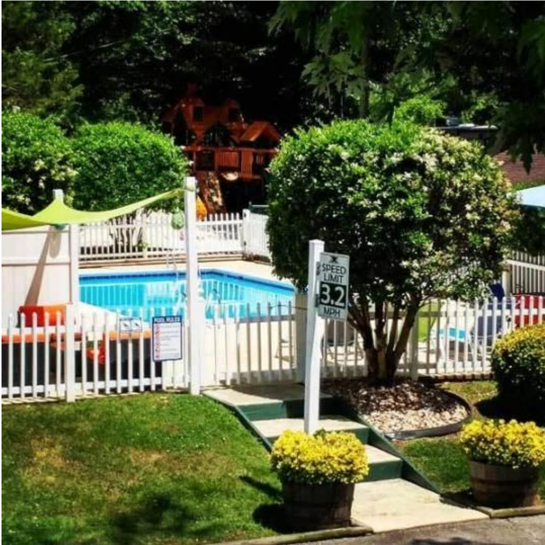
Anvil Campground in Williamsburg, Virginia offers all the amenities of a regular campground plus pool, sand filled playground, WiFi, dog park, general store and so much more.

28 April, 2019 by Olivia Leave a Comment