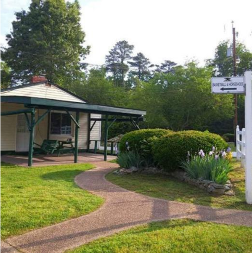
The Blacksmith Cottage at Anvil Campground will easily fit a family or two and has WiFi, full kitchen, bath, fireplace, TV, beds...it is ready to go!