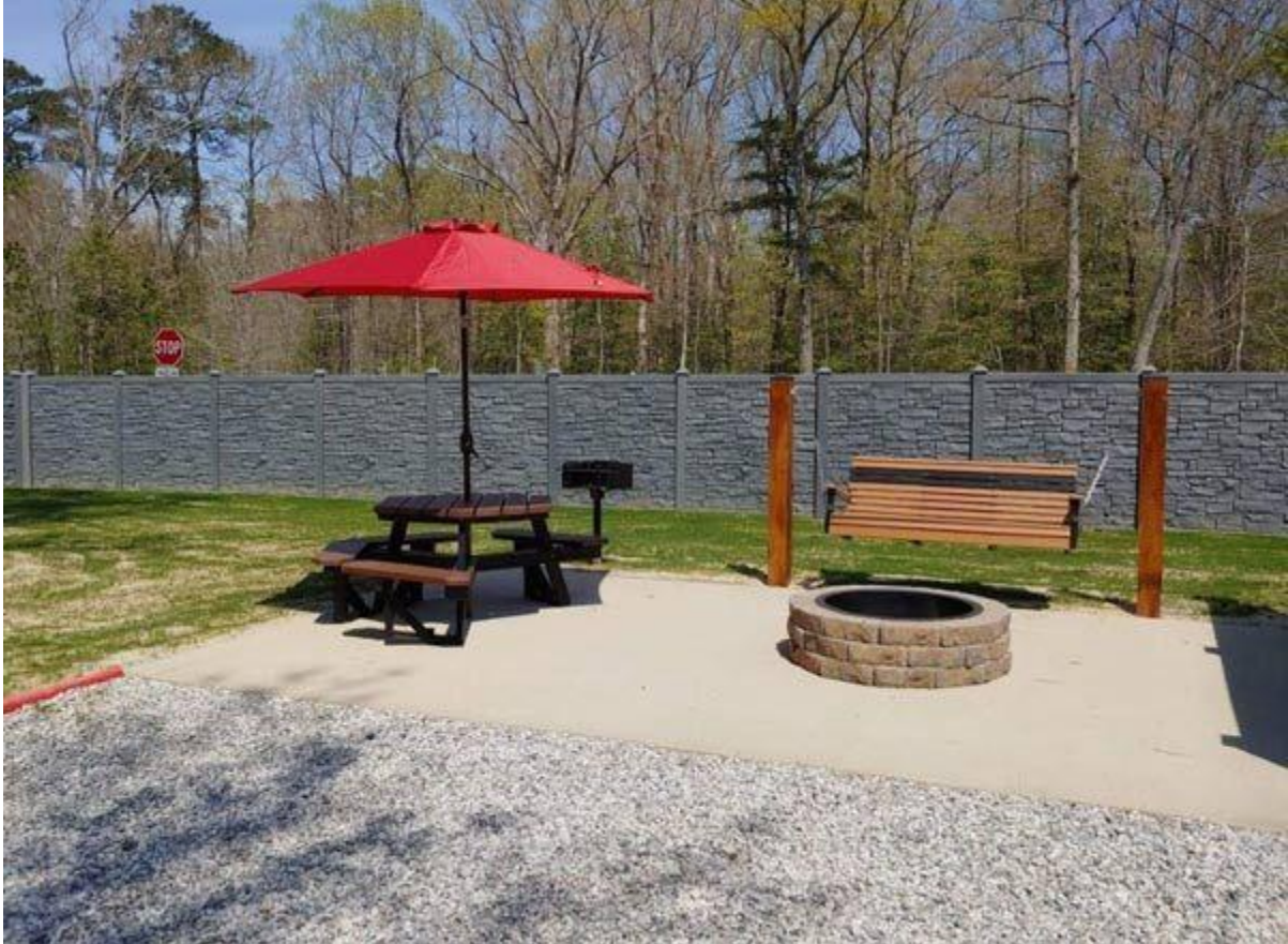
Premium RV sites are spacious, each having their own fire pit, ADA picnic table, grill and swing that has a fold down cup holder!

Their newest addition, the Premium spaces, each have their own new concrete pads where your private stone fire pit rests next to your recycled plastic ADA picnic tables, grill, and swing complete with center folding down drink holder! These have a large grass space as well.