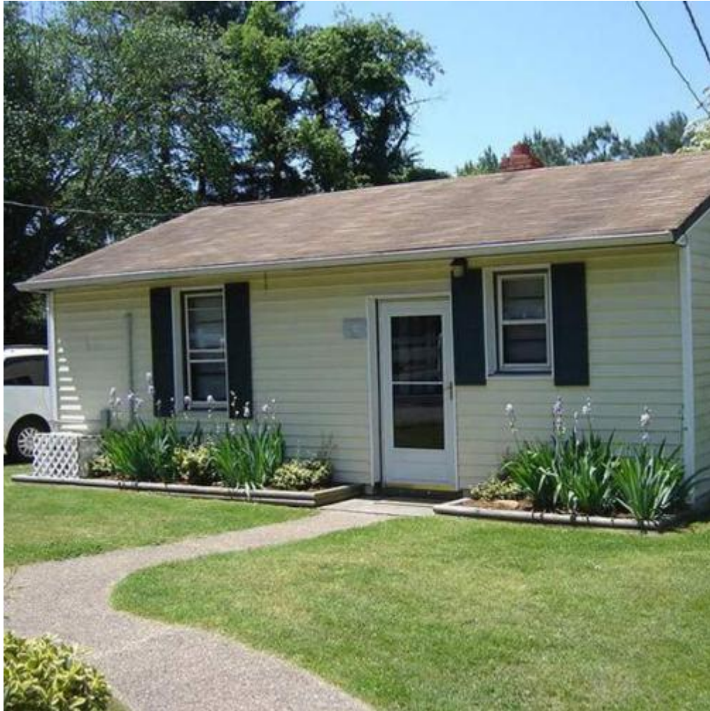
The Journeyman Cottage is the next building as you enter Anvil Campground and it sleeps six, has WiFi, TV, full kitchen, bath and all the comforts of home.

So what is it like? When you drive in the property you are greeted by two large cottages, The Journeyman and The Blacksmith , names reflecting the Anvil's history. These will easily fit a family or two, who want to camp with all the comforts of home including TV, WiFi, cable, private bathrooms, kitchen...the works. Both cottages have outdoor space to grill, relax and even play some basketball.