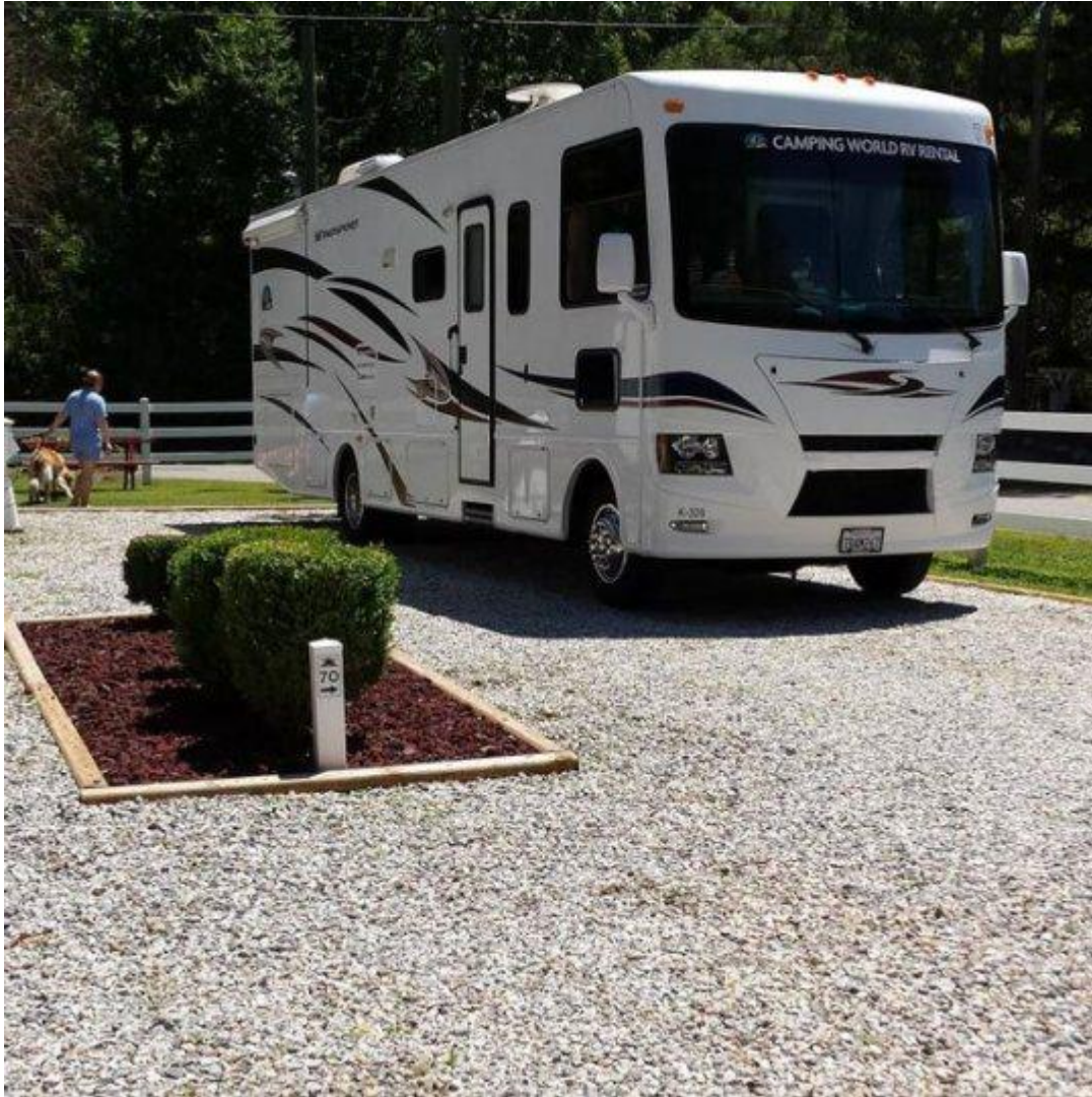
Plenty of room at Anvil Campground in Williamsburg