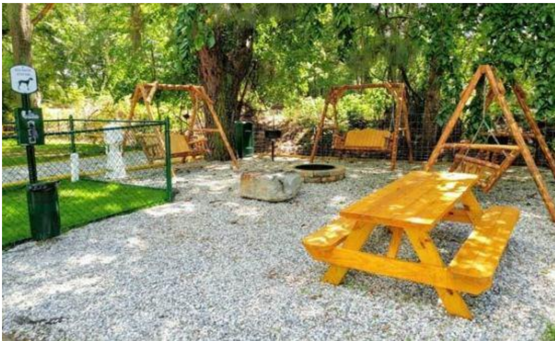
Campfires are surrounded by swings and a dog park so the whole family can enjoy roasting marshmallows.

The playground includes a zip line, beach hammocks, twisty slide, big slide, bumpy slide, mini rock wall, rope merry-go-round with Sand Mountain, airplane seesaw, climbing dome, and the secret swing! The Beach Park is shaded by big trees, and is adjacent to a picnic area with hammocks hanging from the trees.