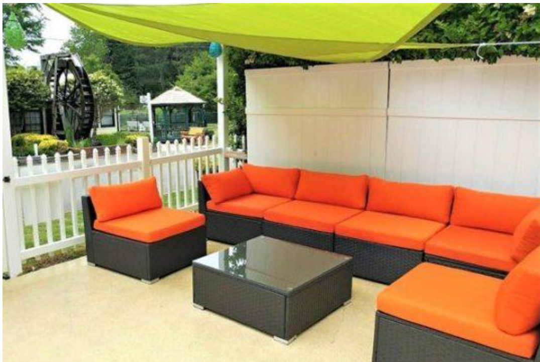
Yes, this is actually a picture of Anvil Campground's beautiful patio near the pool.

If you are like many of their guests, you will get hooked on the place; choosing this award winning campground the next time you return to see more of the Historic Triangle.