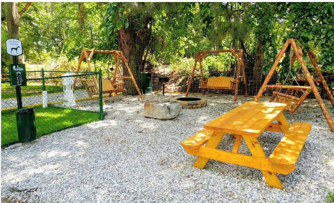
New amenities along with a dog run at one of the park's premium sites.

Anvil also enjoys the distinction of being a top-rated Good Sam Park for the last three years and is the second-highest-rated park in Virginia. The Williamsburg campground has been a Good Sam Park for 35 years.