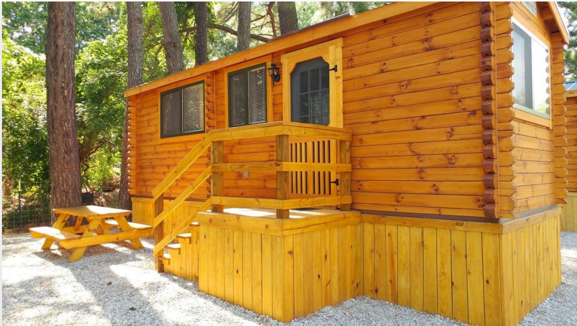
A camping cabin at Anvil Campground.

The utility posts include an amber light for nighttime connecting and hooks to hold an extra water hose.