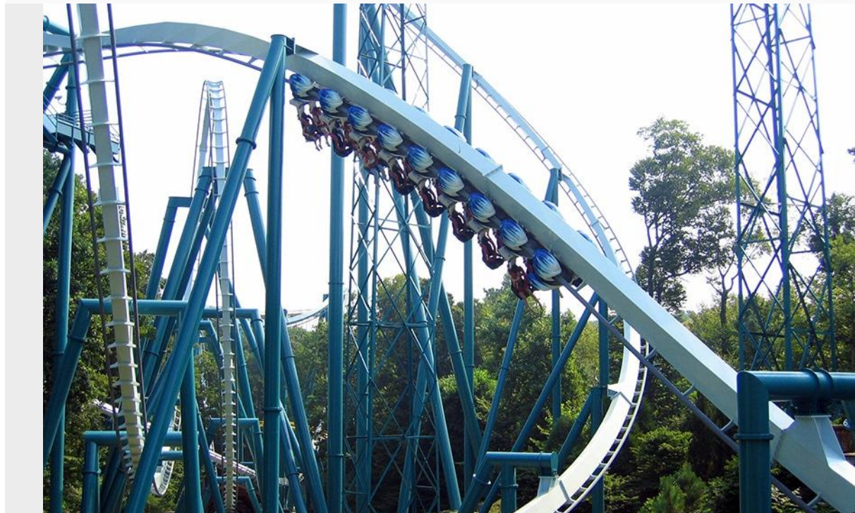
The Alpengeist coaster at Busch Gardens.

Travelers who prefer wild rides to history can find lots of thrills at Busch Gardens. Hop on a coaster like the Loch Ness Monster, dine in European-themed restaurants or enjoy fun family-friendly shows and live entertainment throughout the year.