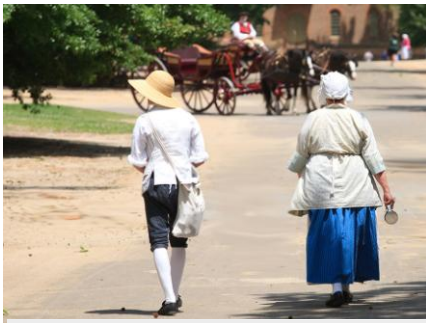
Costumed reenactors walk the streets of Colonial Williamsburg.

Today, many of the guests stay at the park while visiting the 300-acre living history museum, in which costumed performers reenact life in Revolutionary-era America. Back at the campground, the original anvil used for the job is on display at the general store.